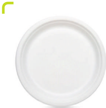
9" Round Plates Packing : 25 pcs x 24 Pkt (600 Pcs/Box) MOQ : 1 Box