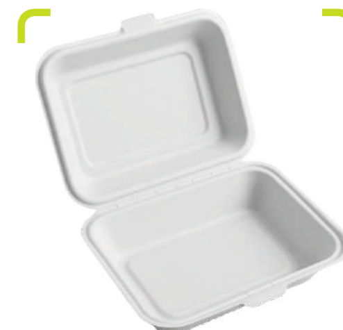
9x6 Clam Shell

Packing : 25 pcs x 96 Pkt (2400 Pcs/Box) MOQ : 1 Box