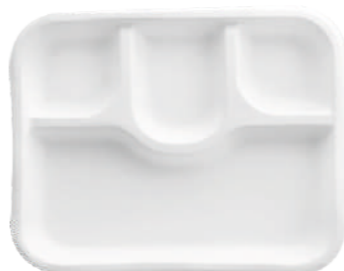
11" Rectangular 4 Compartment Plate Packing : 25 pcs x 24 Pkt (600 Pcs/Box) MOQ : 1 Box