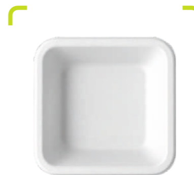
4" Square Dona Bowl

Packing : 50 pcs x 48 Pkt (2400 Pcs/Box) MOQ : 1 Box