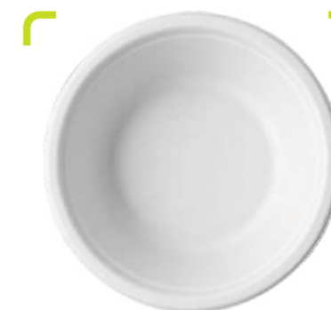
180ml Round Bowl

Packing : 25 pcs x 96 Pkt (2400 Pcs/Box) MOQ : 1 Box