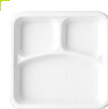
10" Square 3 Compartment Plate Packing : 25 pcs x 24 Pkt (600 Pcs/Box) MOQ : 1 Box