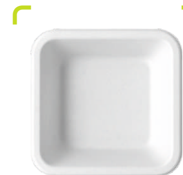
5" Square Dona Bowl

Packing : 25 pcs x 96 Pkt (2400 Pcs/Box) MOQ : 1 Box