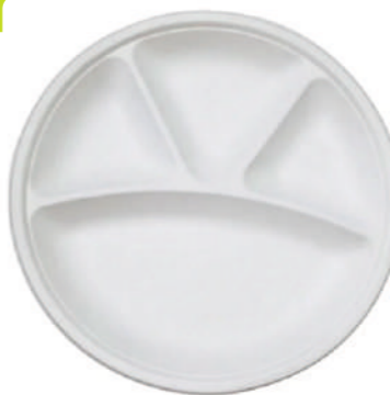
11" Round 4 Compartment Plate Packing : 25 pcs x 24 Pkt (600 Pcs/Box) MOQ : 1 Box