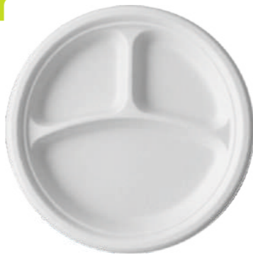
9" Round 3 Compartment Plate Packing : 25 pcs x 24 Pkt (600 Pcs/Box) MOQ : 1 Box