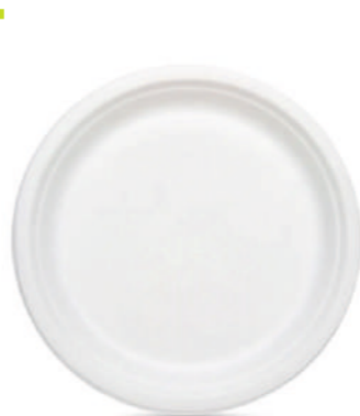
11" Round Plates Packing : 25 pcs x 24 Pkt (600 Pcs/Box) MOQ : 1 Box