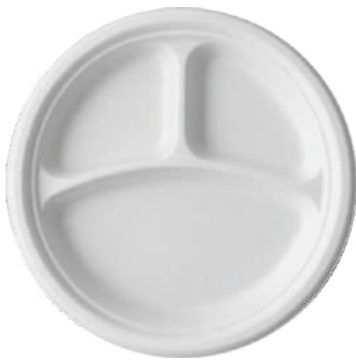
10" Round 3 Compartment Plate Packing : 25 pcs x 24 Pkt (600 Pcs/Box) MOQ : 1 Box