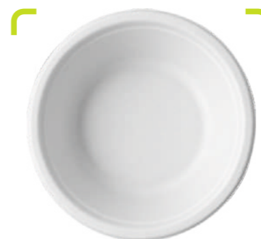
120ml Round Bowl

Packing : 25 pcs x 96 Pkt (2400 Pcs/Box) MOQ : 1 Box