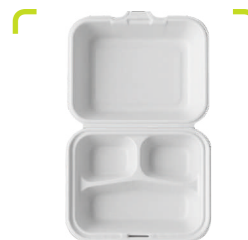
9x9 Clam Shell 3 Compartment

Packing : 25 pcs x 40 Pkt (1000 Pcs/Box) MOQ : 1 Box