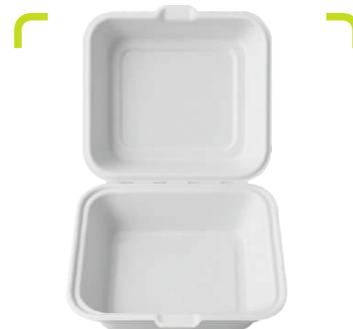
9x9 Clam Shell

Packing : 50 pcs x 48 Pkt (2400 Pcs/Box) MOQ : 1 Box