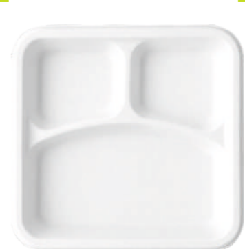
9" Square 3 Compartment Plate Packing : 25 pcs x 24 Pkt (600 Pcs/Box) MOQ : 1 Box